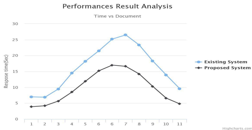
Fig 2. Time vs Document

Keyword query suggestion approaches can be classified into three main categories: random walk based approaches, learning to rank approaches, and clustering based approaches. We also briefly review alternative methods that do not belong to any of these categories.